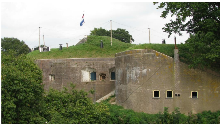
Fort Vuren, home of the former Dutch 898 Verbindingsbataljon