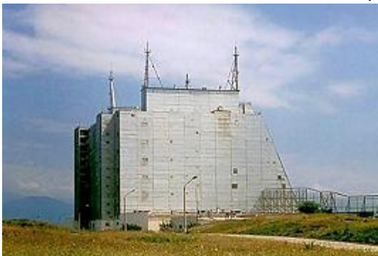
Gabala Radar, Azerbaidjan

Later on, the Soviets modernized their equipment which implied that the number of morse and voice transmissions decreased substantially. The new equipment had NATO designation G3C, or SWAMP. This system worked on the principle that the radar operator simply put a light pen on the trace on his radar screen, and this was automatically transformed into a signal that gave the same information as a manual plot, but much faster. It was read automatically by the controlling station and again, plotted automatically on a master screen. Thus the controlling station had a very quick overall view of the sector it was responsible for. The signal was roughly built up as shown in the graphic below.